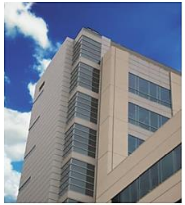
In April 2016, the Highland Acute Care Tower opened to the public. The Tower is a 9-story centerpiece of the $668 million, multi-year project to modernize the historic Highland campus. It houses inpatient services, a family birthing center, a Neonatal Intensive Care Unit, a state-of-the art Diagnostic Imaging Service Center, physical/occupational/speech therapy suites, a technologically advanced laboratory, as well as predominantly private rooms with views of Oakland.